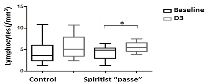
Chart 2 – Lymphocyte absolute values were compared between the control (NBs exposed to the laying on of hands with healing intention) and the experimental group (NBs who received the Spiritist "passe") before the beginning of the study (Baseline) and after the third day of intervention (D3).

Baseline, before the start of interventions; D3, 3 rd day after the interventions. The horizontal lines represent the medians, the bars represent the 25 th and 75 th percentiles and the vertical lines the minimum and maximum values. * p < 0.05 .