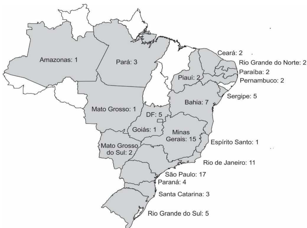
Figure 3. Distribution of research groups on functional disability in Brazil.

highest number of research groups (n=17; 18.7%), followed by Minas Gerais (n=15; 16.5%) and Rio de Janeiro (n=11; 12.1%). In the states of Amapá, Acre, Maranhão, Rondônia, Roraima and Tocantins, no research groups were found on the subject of functional disability.