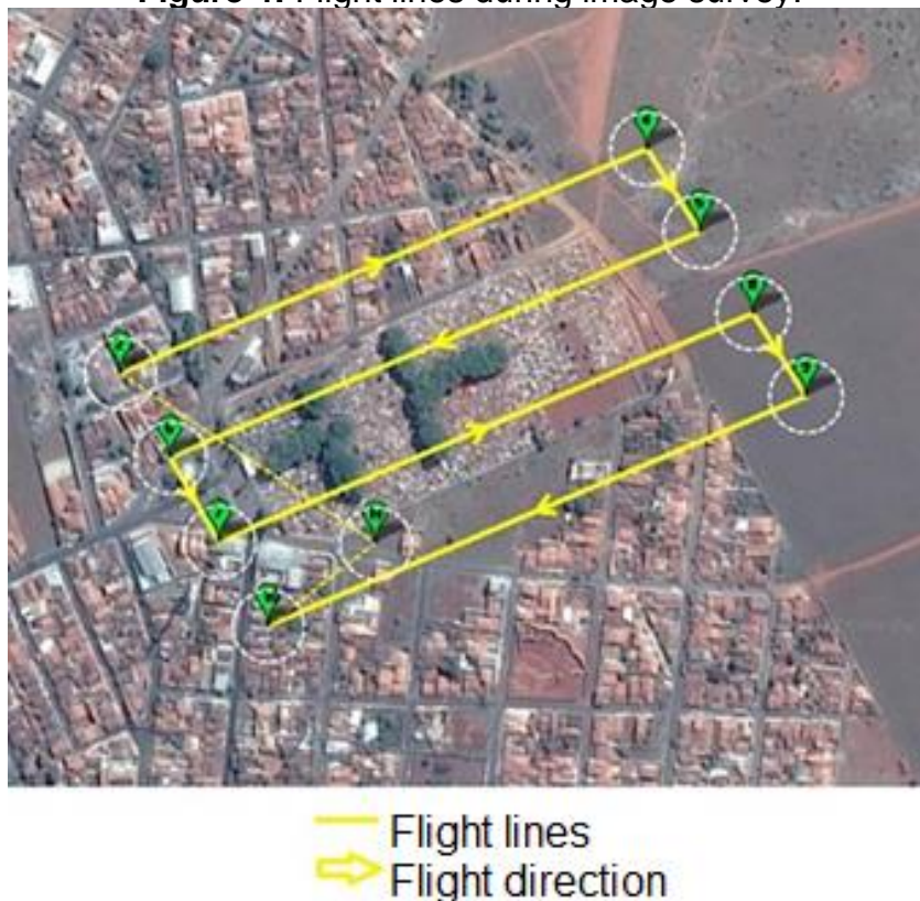
Figure 4: Flight lines during image survey.

To plan and execute the aerial survey for this work, the overflow target was first determined, in this case, the municipal cemetery of Monte Carmelo. Therefore, 80% superposition, 12-megapixel spatial resolution, 120-meter flight height for a total of 114 m 2 of covered area were defined. Thus, there was a reprojection error of only 1.05 pix and a total of 32 images. Thus, the overlapping of photos ranged from 2 to 9 photos, 9 at the central region of the generated model. In Figure 4 , the lines of flight during the aerial survey are presented, that is, the path that the UAV took when traveling through the area.