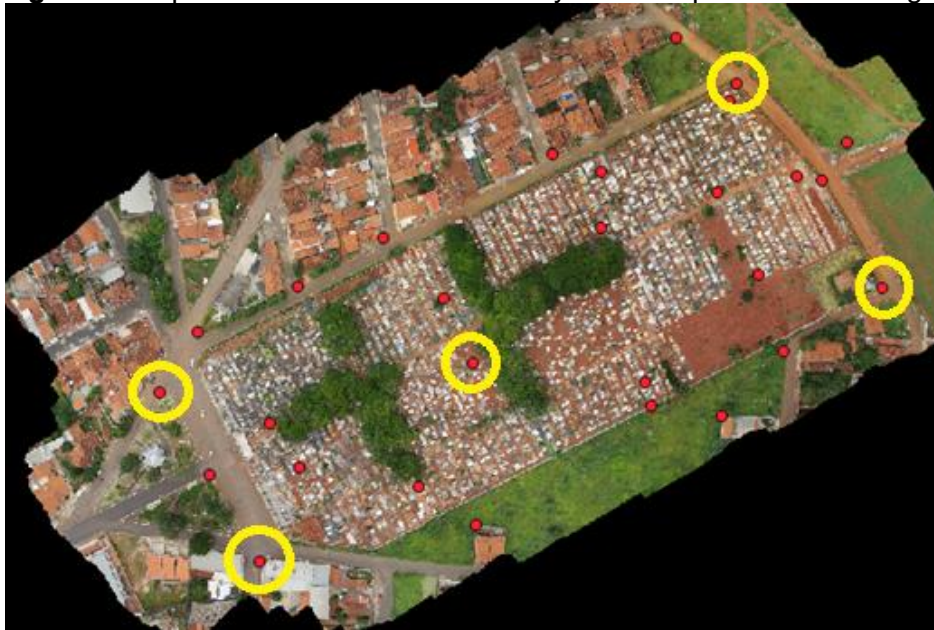
Figure 8: Representation of the 5 randomly selected points in the image.