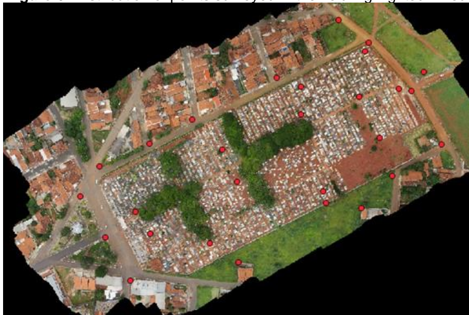
Figure 6: Distribution of points surveyed in the field highlighted in red.