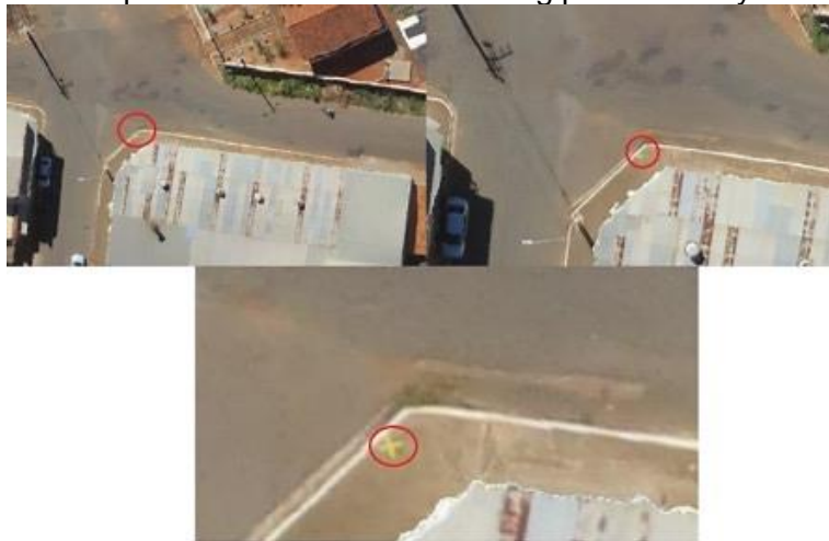
Figure 5: Example of the method for selecting points surveyed in the field.

Before starting the collection, the positions of the support points in the field were carefully planned for georeferencing the cartographic material, so that they were photoidentifiable, that is, they were found in places of easy recognition on the image, such as, corners on the ground, burial edge points and cross-shaped, paintings which were done in some locations, as seen in Figure 5 . These points were then tracked using RTK. It is noteworthy that these points were divided into two groups, one used for geometric correction of the image, and the other for product verification. The spatialization of these points is illustrated in Figure 6 .