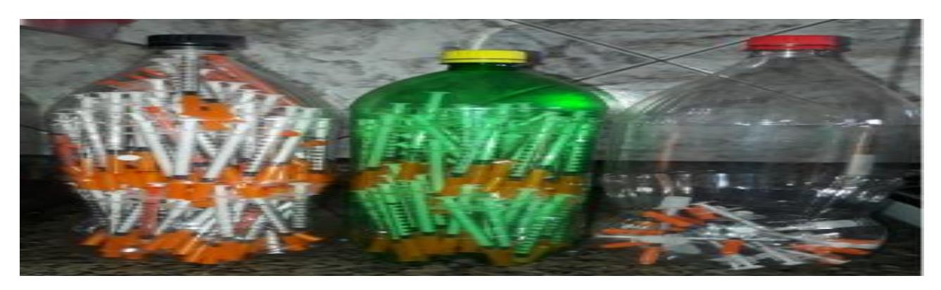
Figure 2: Disposal not recommended in PET bottles.

A box for sharp and perforating materials must be provided by a competent institution, or in a rigid, resistant, unbreakable container, with a wide opening and lid<sup>4-6</sup>. Disposal in plastic bottles (Figure 2), identified by students, should be avoided due to the fragility of this material<sup>4,6</sup>. Once completed, the collector must be delivered to a qualified health service for proper treatment and destination<sup>4,6</sup>. Incorrect disposal of sharpand perforating materials from insulin therapy can cause accidents and thus transmit infectious diseases (especially HIV/AIDS, hepatitis B and C) among family members, the community and garbage collectors<sup>4</sup>.